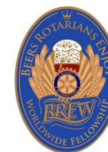
Lifetime and Annual Membership Pin